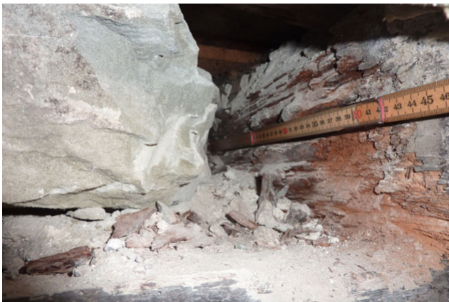
Ceiling beam support in the outer wall in the wine cellar before renovation