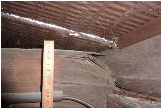
Support for wine cellar beams before renovation