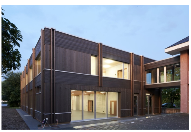
West facade with the seven meter wide window front and the passerelle into the old building