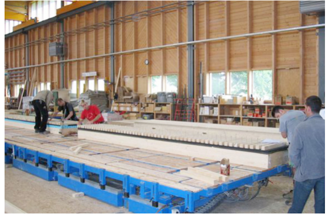
Production of roof elements