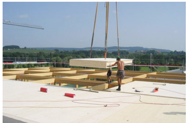
Assembly of roof elements