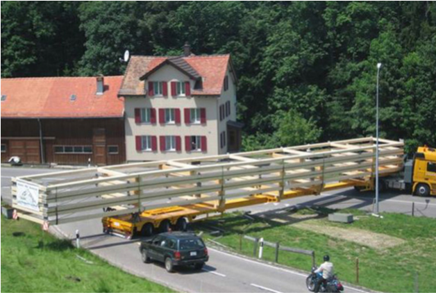
Detail with GSA technology Transport Binder: It's narrow in Appenzellerland