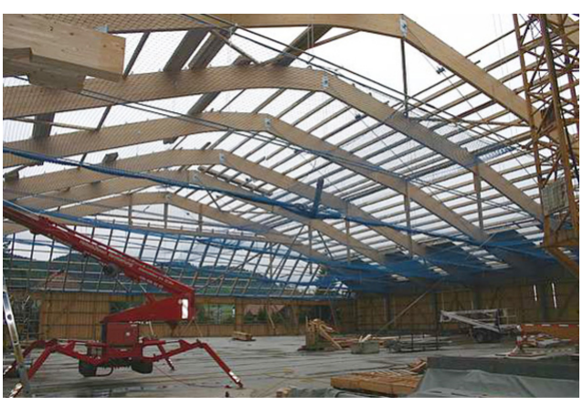
Setting up the binder