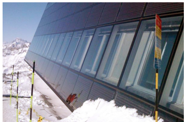
Facade with photovoltaics