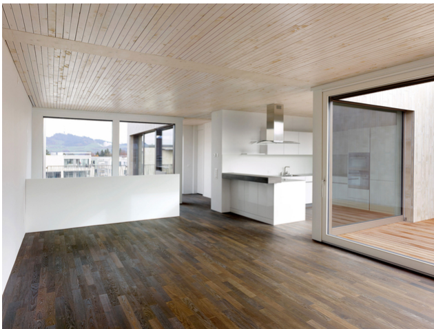
Living room and kitchen