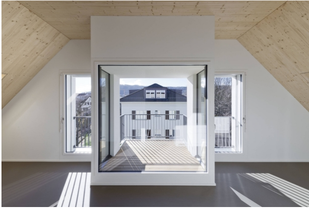
View from balcony with interior atrium