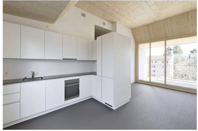
Successful combination of materials in the kitchen