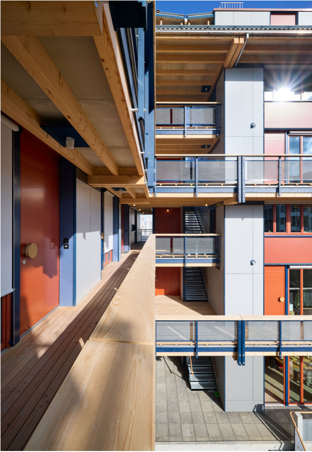
Exterior view of the pergola