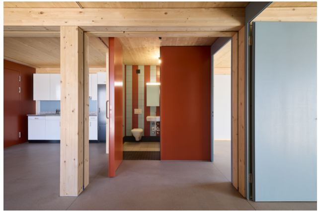
Striking wooden structures in the interior design