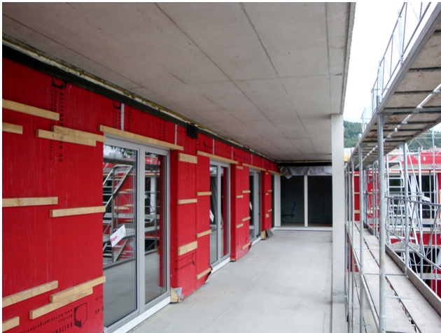
Pergola in the shell