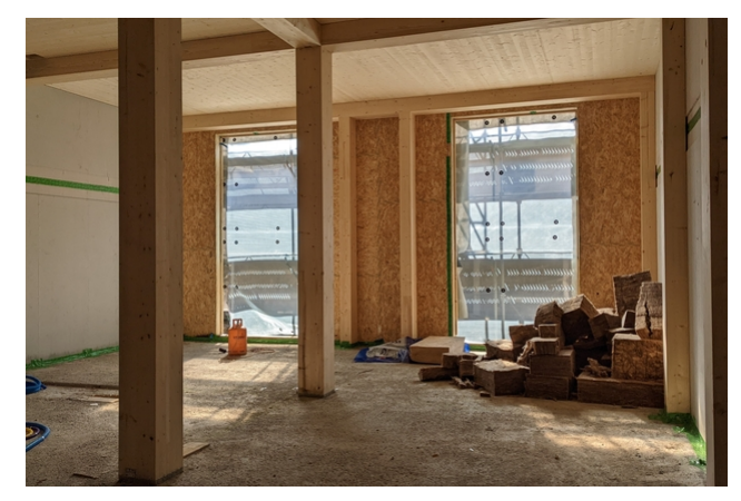
Behind it, the new wooden building is being built.