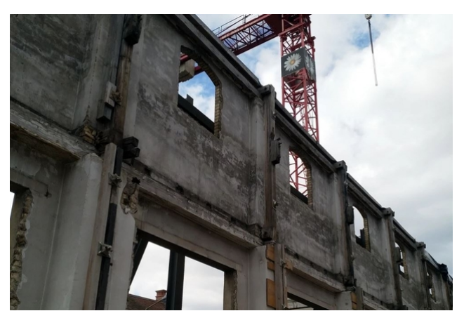
The building was deconstructed except for its facade.