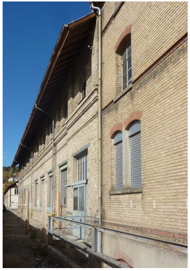
The facades are partially listed.