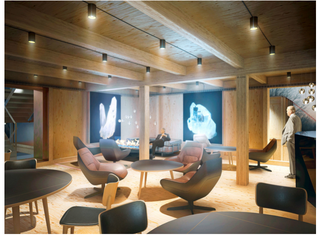
Interior visualization of the lounge