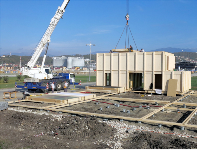
Montage in Sochi