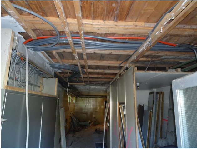
Ceiling before retrofitting