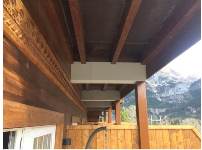
HEB beam clad