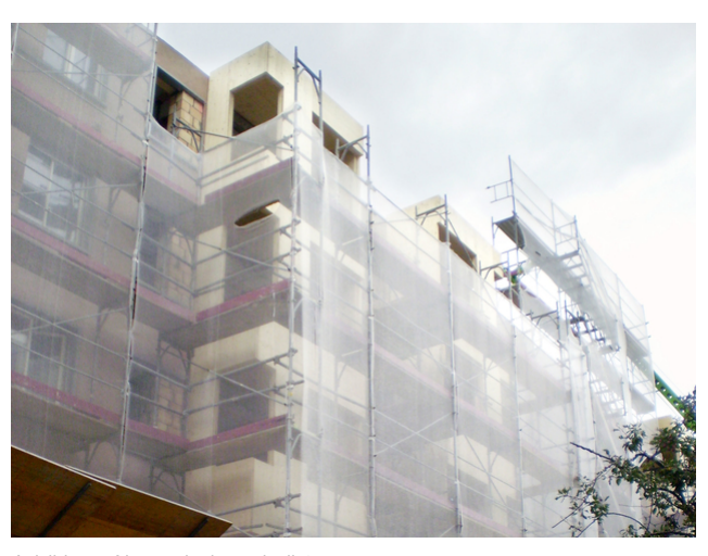
Addition of bay window shell 2