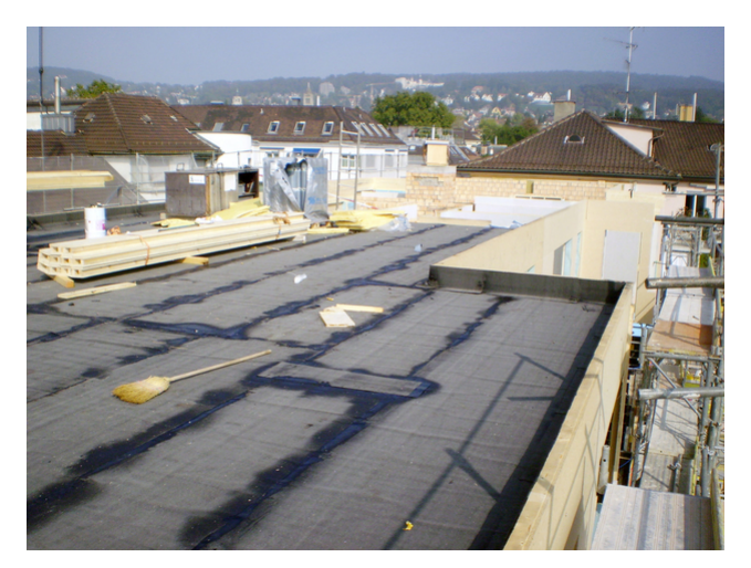
Elevation bay window shell