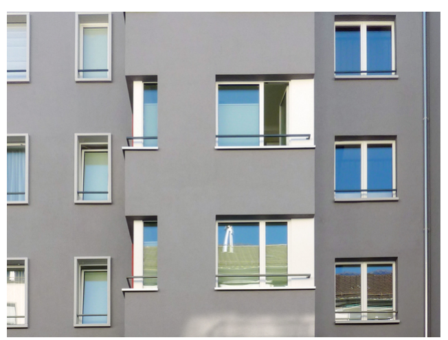
Bay window finished