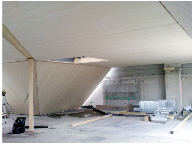
Interior view throat