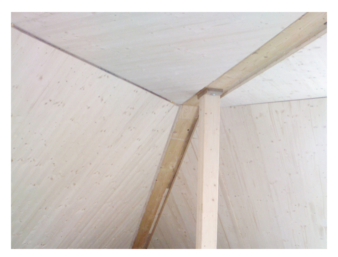
Interior view ridge