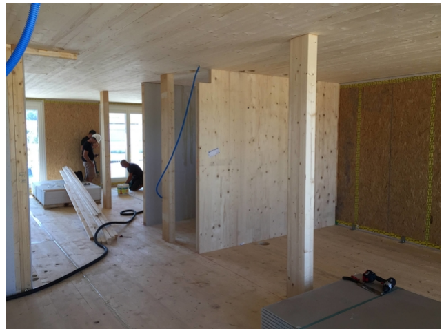
Supports and slabs in the shell