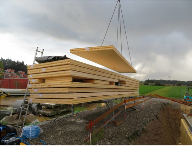
Delivery of CLT panels to the construction site