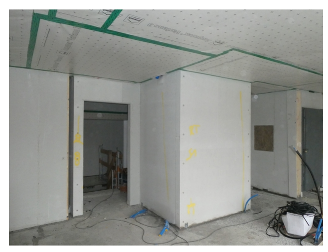
Encapsulated staircase in the construction phase