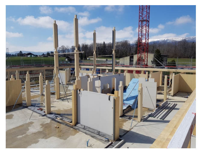
First floor under construction.