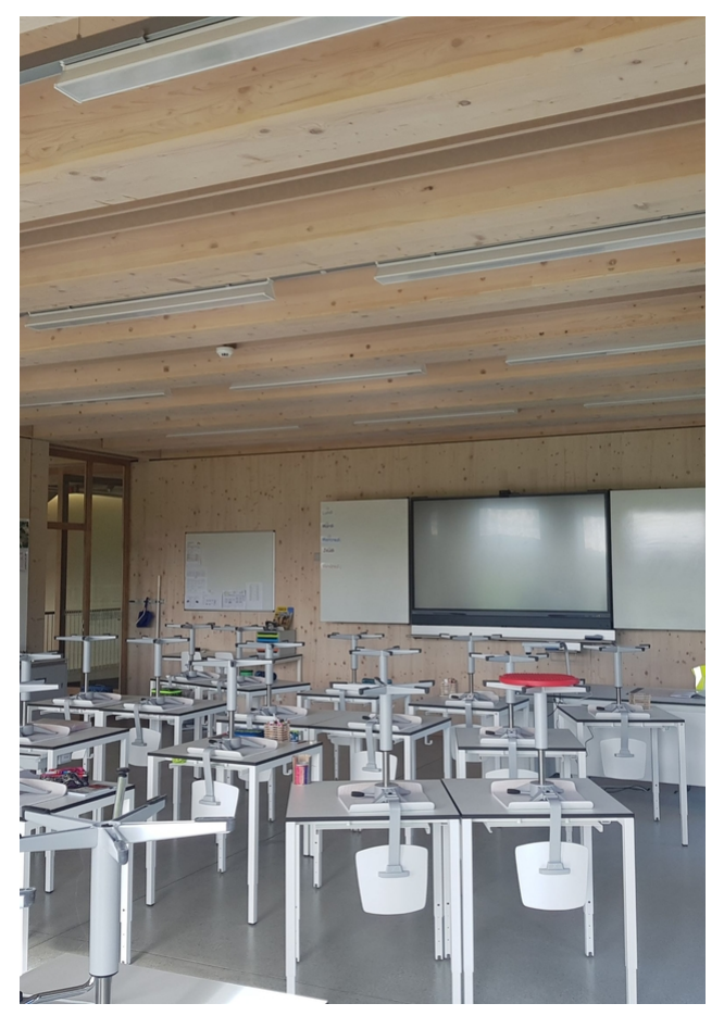
Interior of a classroom.